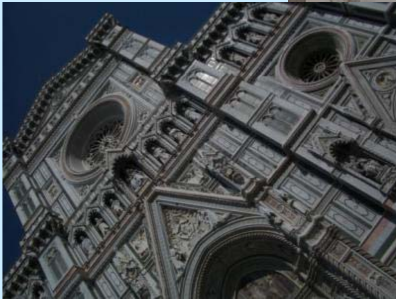
Cattedrale di Santa Maria del Fiore